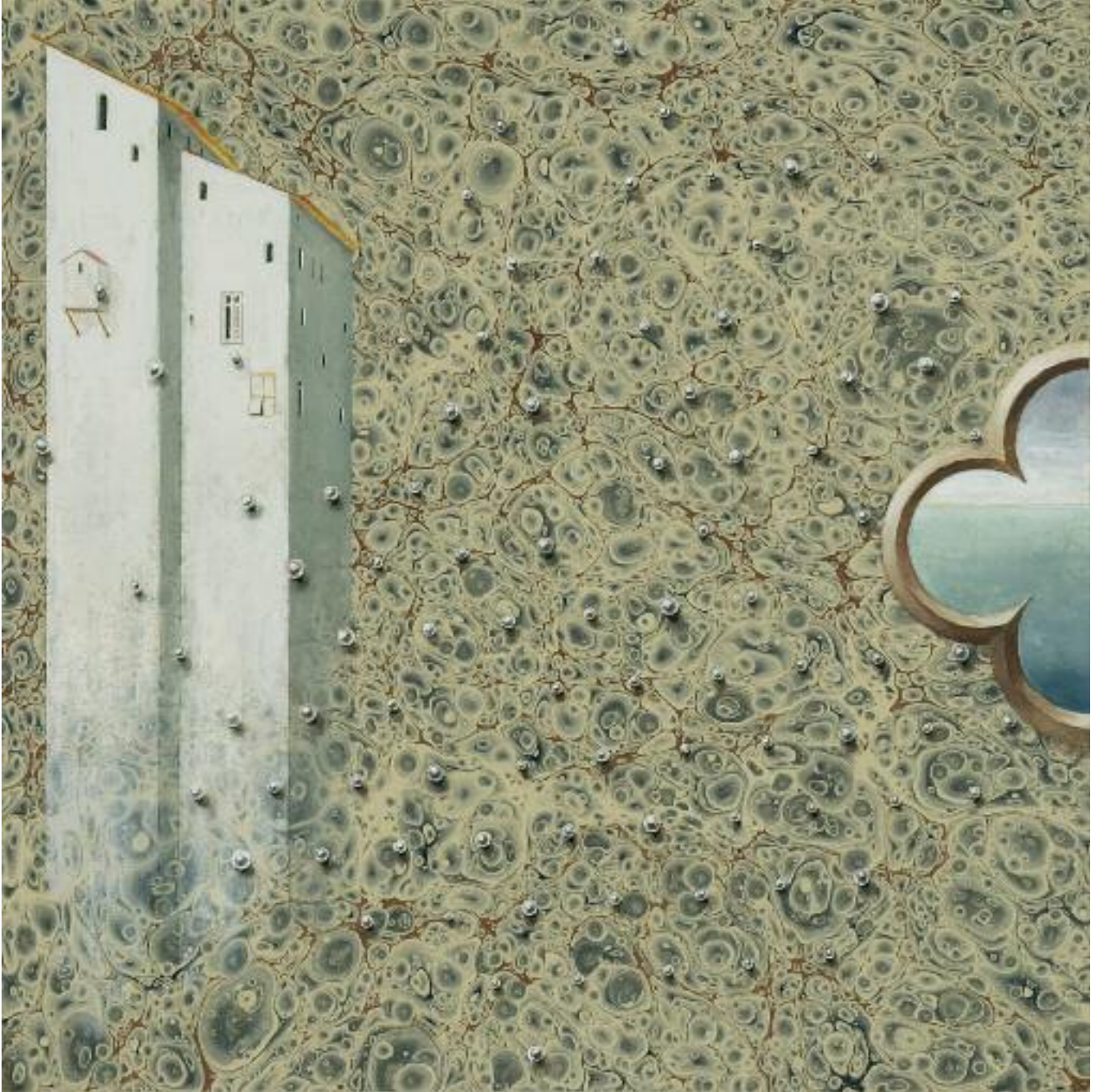
7. Study with Towers