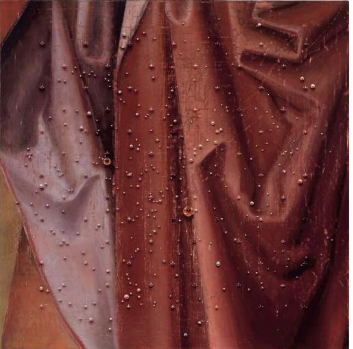
9. The Million Lamps of Heaven