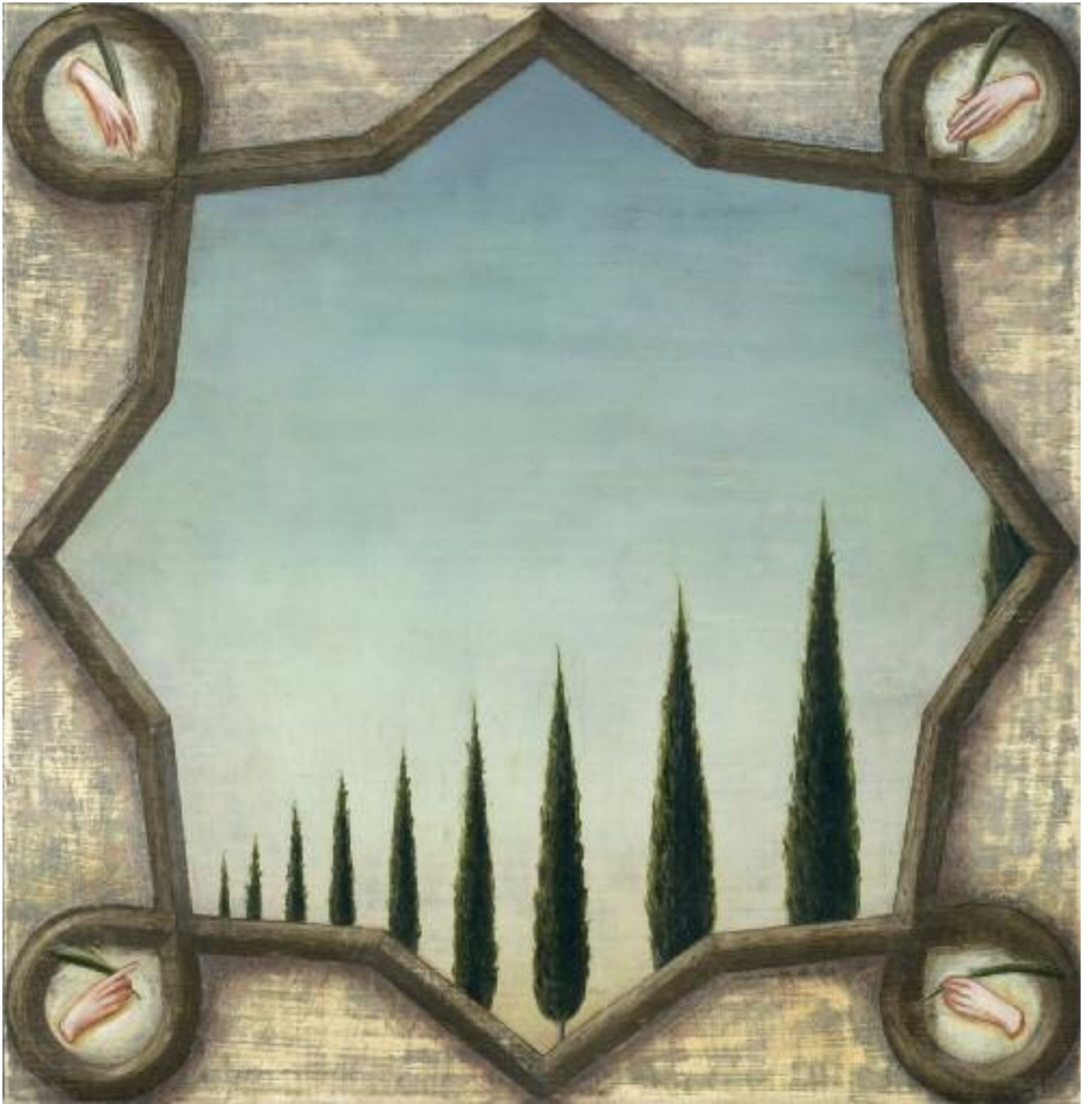
10. Constancy and Ardour