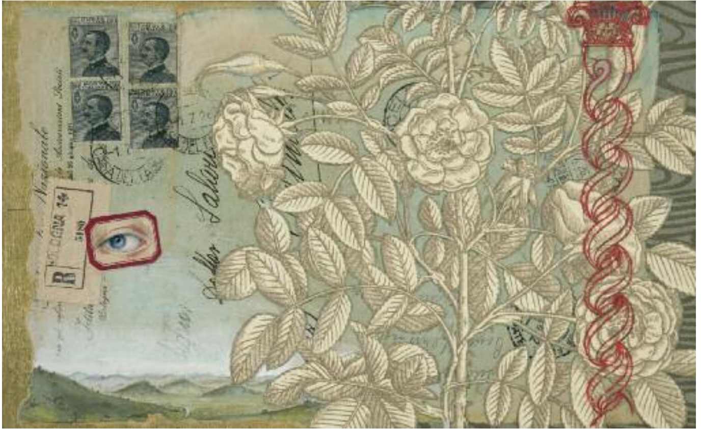
8. A Favourable Reply