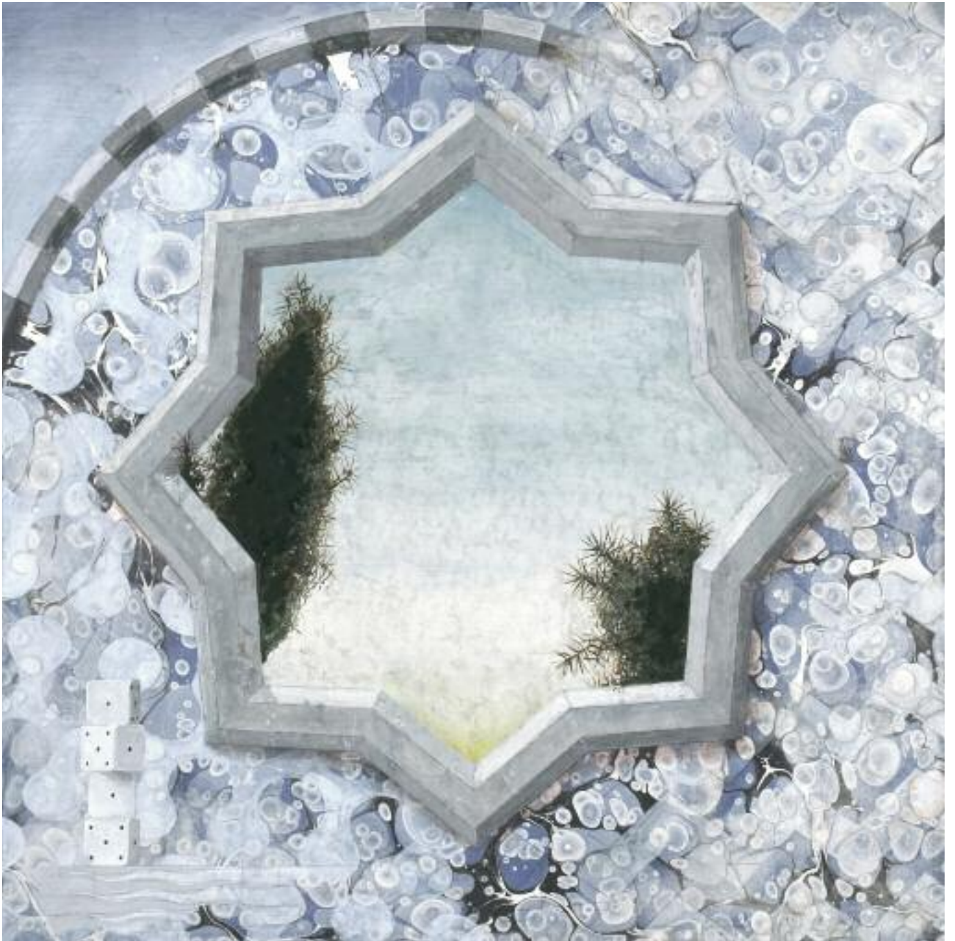
2. Study with Juniper